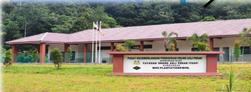
CSR - Pusat Kecemerlangan Pendidikan Orang Asli Perak

Earliest Collection & Recorded Artifacts Of OA